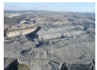
12,000 acre mountaintop removal site just a few miles from Coal River Mountain