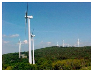
Wind Turbines on intact mountains in West Virginia